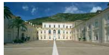
Real Sito Belvedere di San Leucio - Caserta