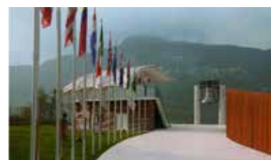
Fondazione Opera Campana dei Caduti - Rovereto (Tn)