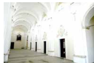
Ex Convento dei Francescani Neri - Specchia (Le)