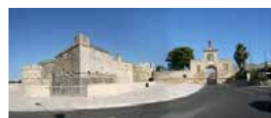
Castello di Acaya - Lecce