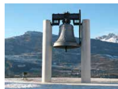
Fondazione Opera Campana dei Caduti - Rovereto (Tn)

Since 2010 HUMAN RIGHTS? each year it obtained the patronage of the Council of Europe and in 2013 the patronage of the Presidency of the Chamber of Deputies and the Ministry of Cultural Heritage and Activities. In all other editions, patronage was granted by official institutions, such as the Italian Commission for UNESCO.